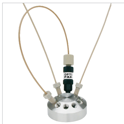
Trap Cartridges are available in a variety of configurations, bed sizes and chemistries.