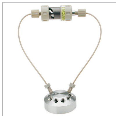
Clean up & enrich your protein, peptide and small molecule samples on-line with OPTI-LYNX quick-connect trap cartridges.